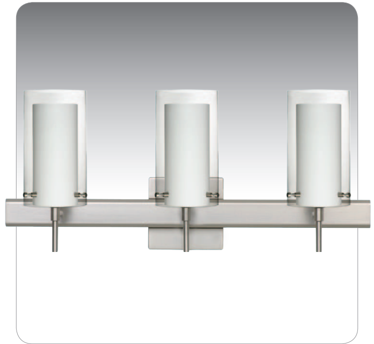
VANITY LIGHT SHOWN IN CLEAR/OPAL WITH SQUARE CANOPY

UL or ETL Listed. Suitable for Damp Locations (interior use only).