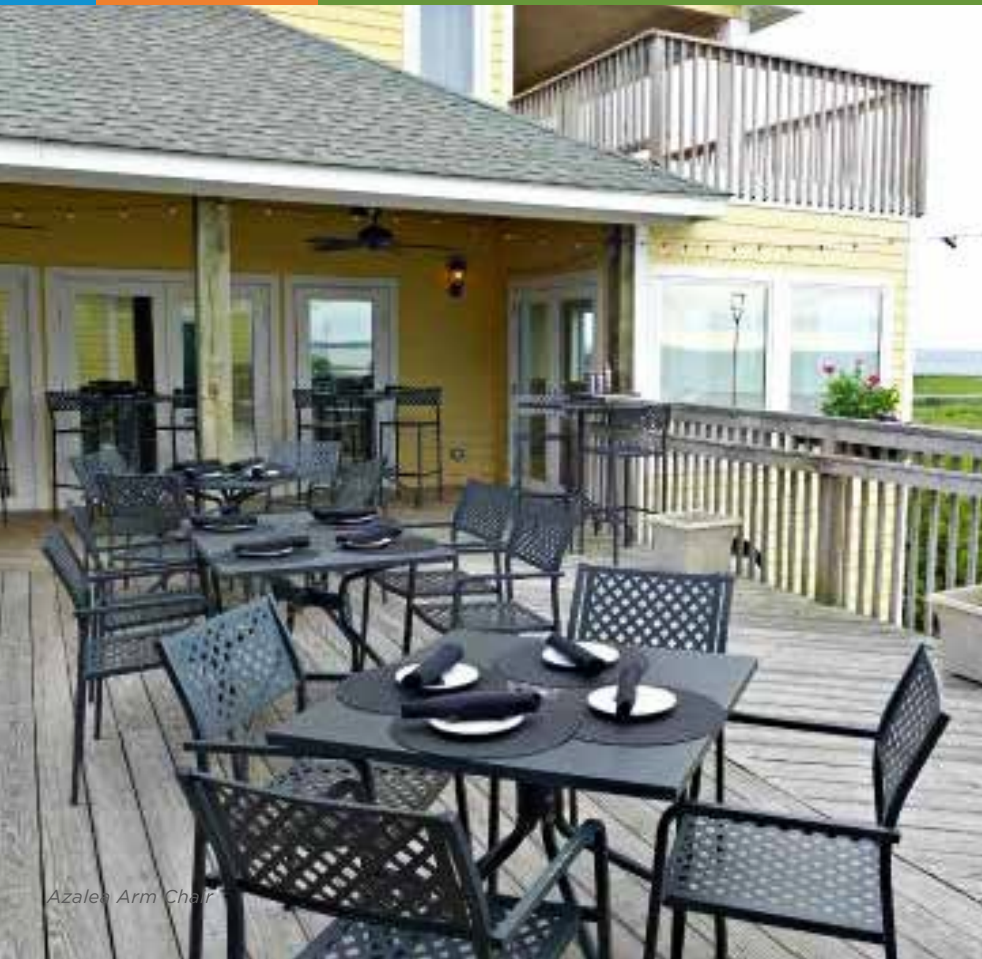
Azalea Arm Chair