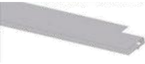
④: Back Fixing Bar