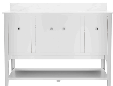
● Bathroom Vanity(With Backsplash)