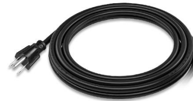
70" Power Cord