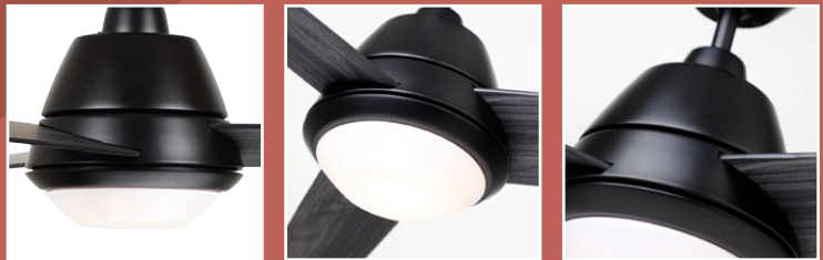
INTEGRATED DIMMABLE LED Light Fixture