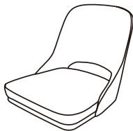
Chair Seat *1