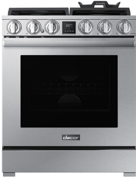
DOP30T840GS/DA - Silver Stainless, Natural Gas/Liquid Propane