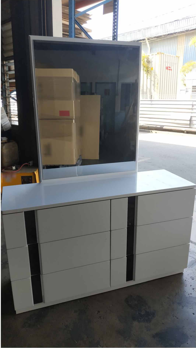
Assembled dressing table.