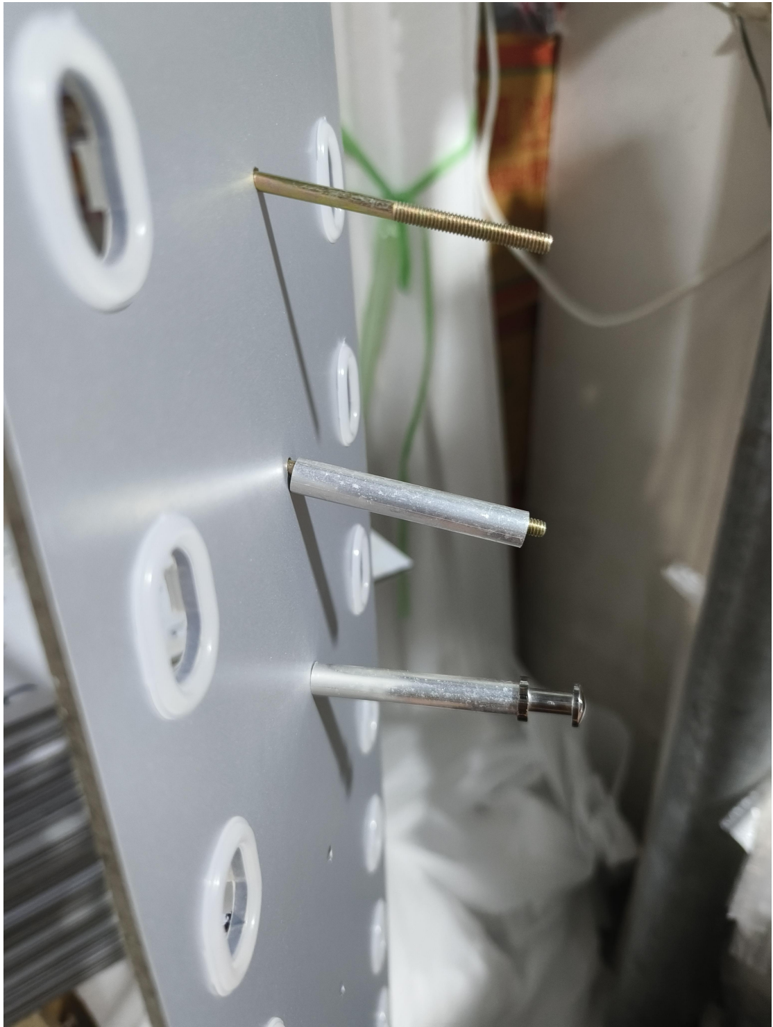
Step 3: Install the hardware bracket on the board.