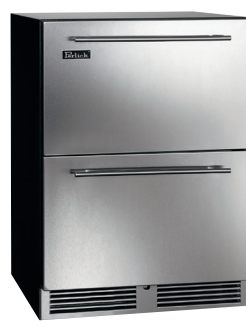
Drawer Model (Indoor)