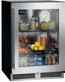
Glass Door Model (Indoor)

HC24RB-3 24" INDOOR MODEL HC24RO-3 24" OUTDOOR MODEL