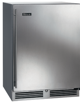
Solid Door Model (Outdoor)