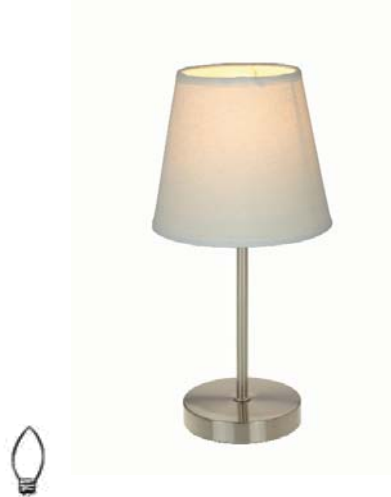
1 x 60w Max type B candelabra base bulb (not included)