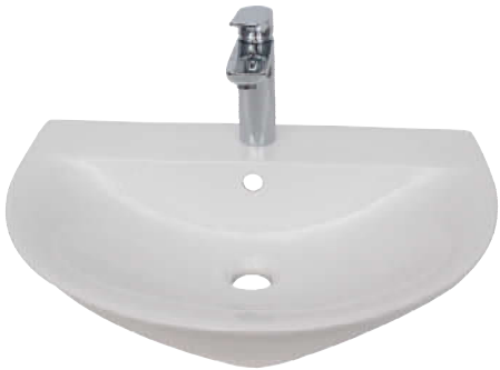
Faucet not included