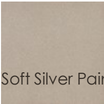
Soft Silver Paint