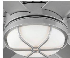
-23 w/ Lightkit

SPECIFICATIONS 6 Blades / 100" Blade Sweep / 11.5° Blade-Pitch 10" downrod 6 Speeds - Reversible; 0.45A on high / 0.09A on low 54W on high / 4W on low 93 rpm on high / 20 rpm on low Wall control (Included) Optional support to Ceiling (Cables and hardware Included)