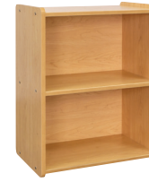
TMS301R HARDWARE BAG# 0563-3293