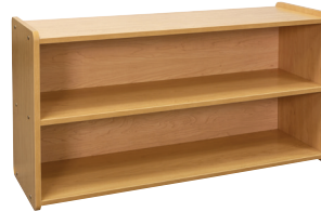
TM2302R HARDWARE BAG# 0563-3293