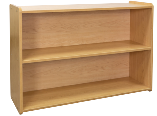
TM2304R HARDWARE BAG# 0563-3293