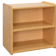
TMS302R HARDWARE BAG# 0563-3293