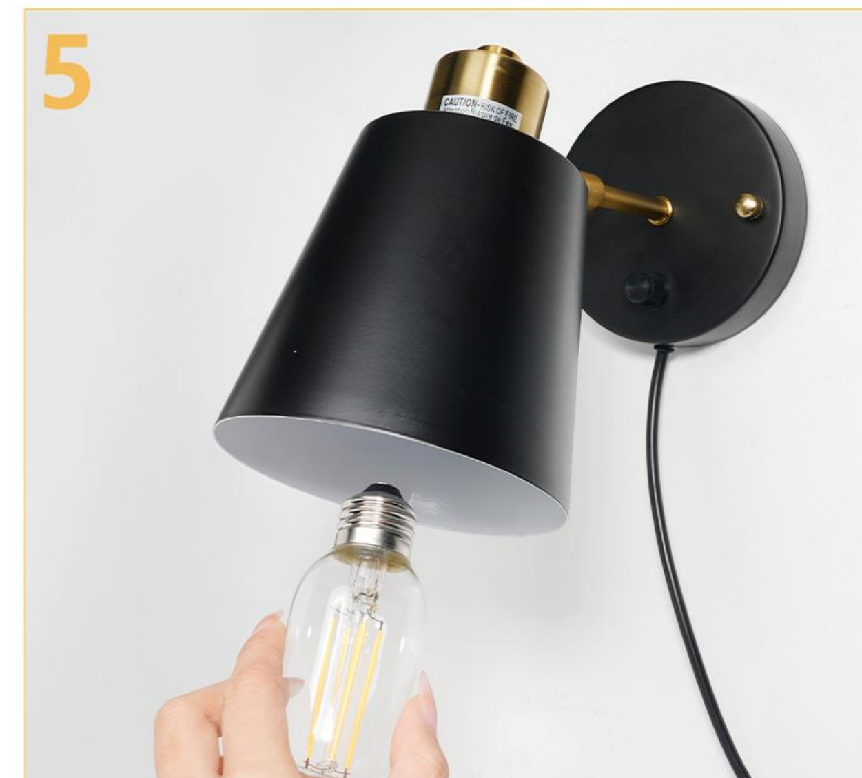
Install an E26 bulb into the socket base.