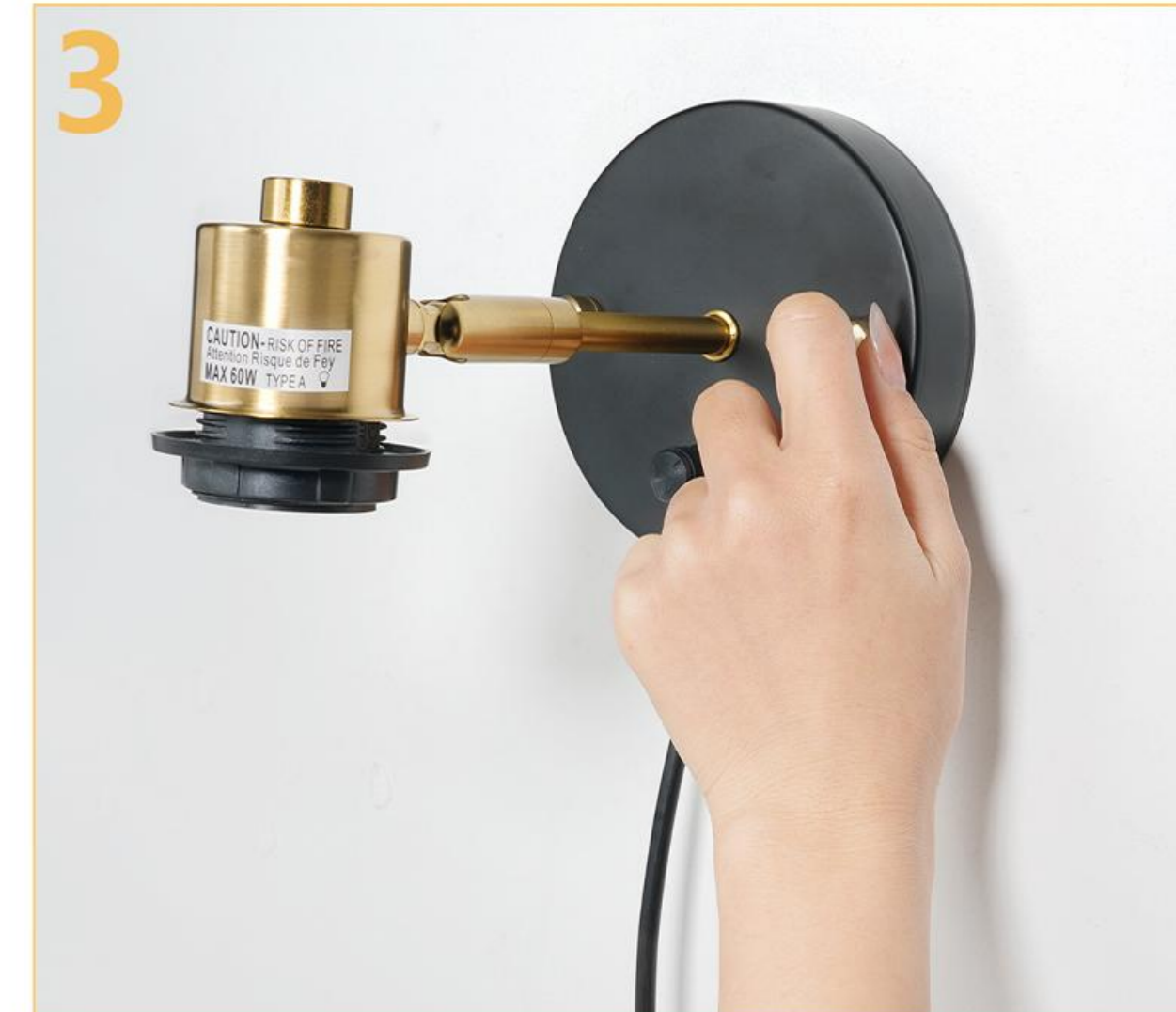
Align the lamp base with the bolt and tighten the nuts.