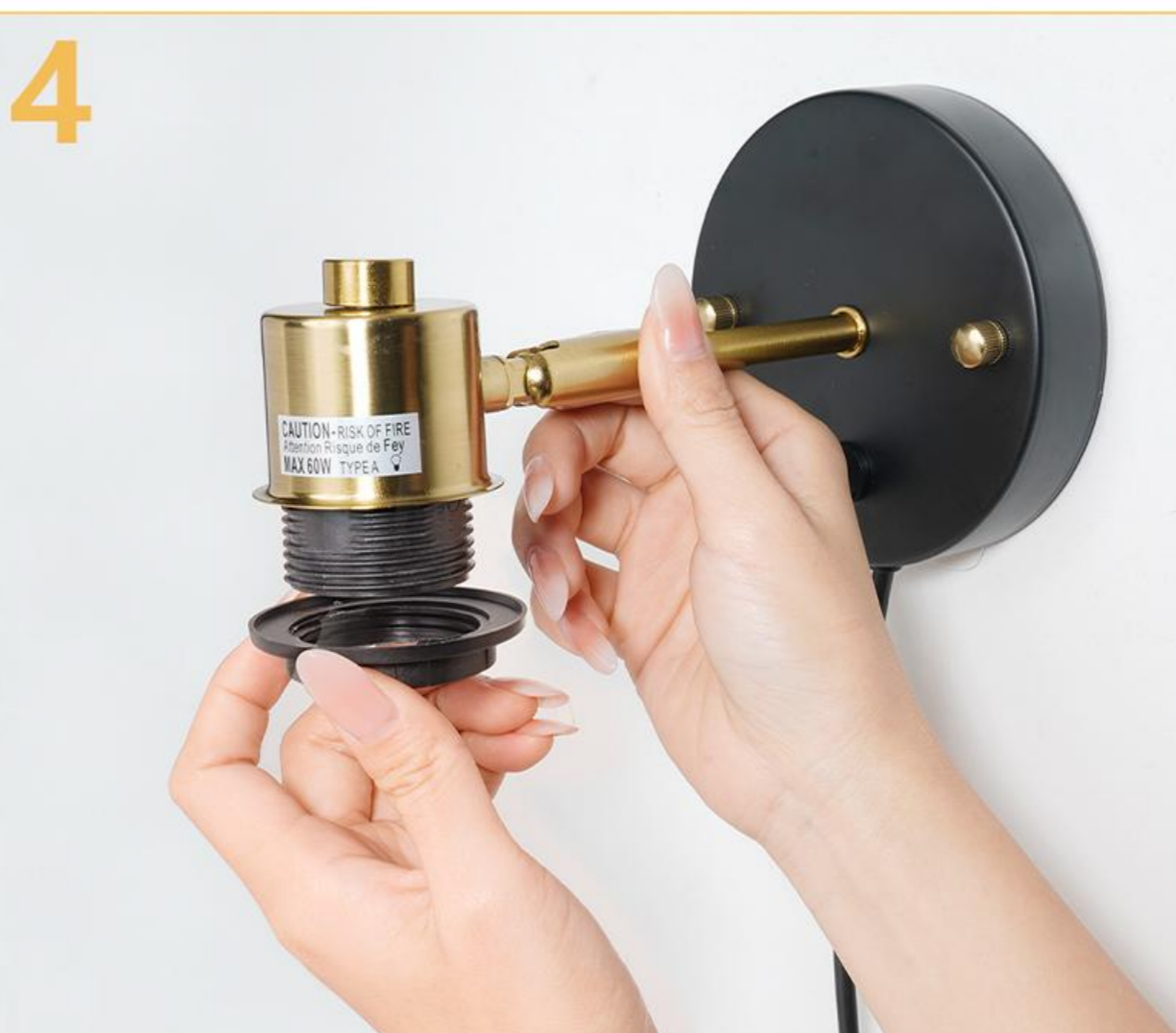
Remove the plastic ring and then secure it with the shade.