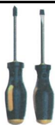
Phillips Head, Flat Blade Screwdrivers