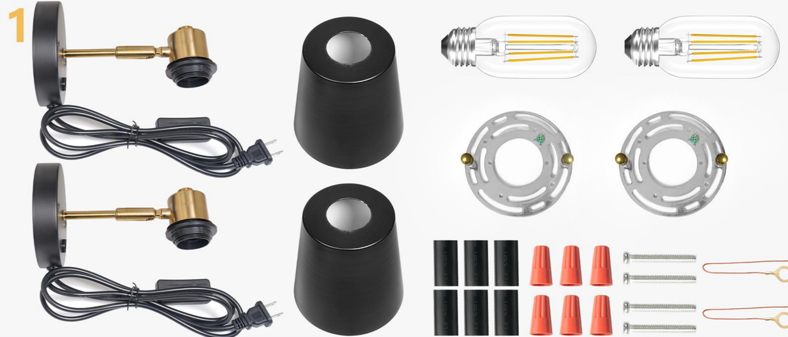
All parts are prepared in the package.