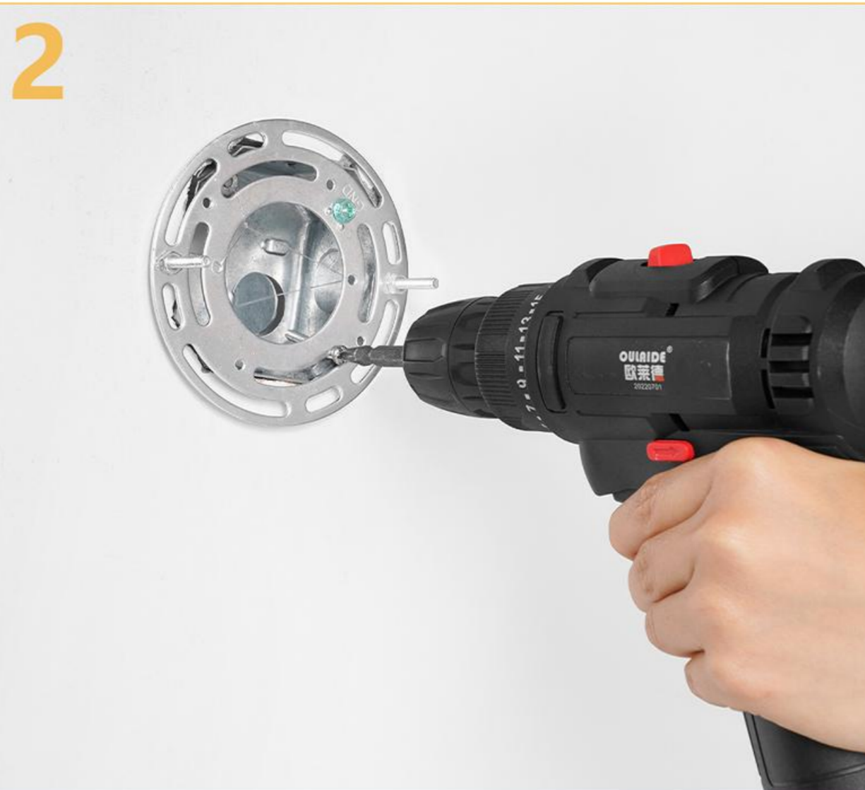
Tighten the mounting plate to the wall.