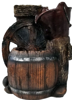
Fountain Base 1x