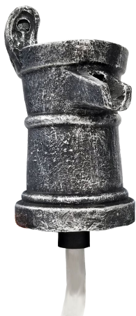
Fountain Top 1x