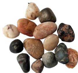
Bag of Rocks 1x