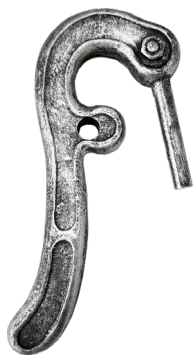
Water Pump Handle 1x