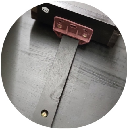
Solid wood drawer glide rail