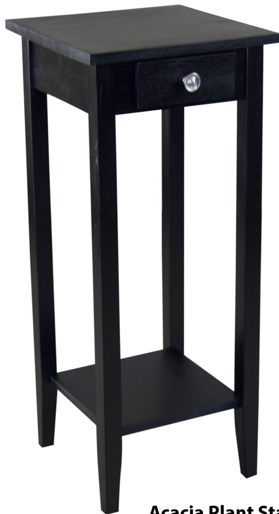
Acacia Plant Stand in Black