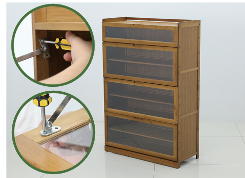
⑪ Secure Hinges (r) and Side Frame (a, b) with Small Screws (q). Close the door.