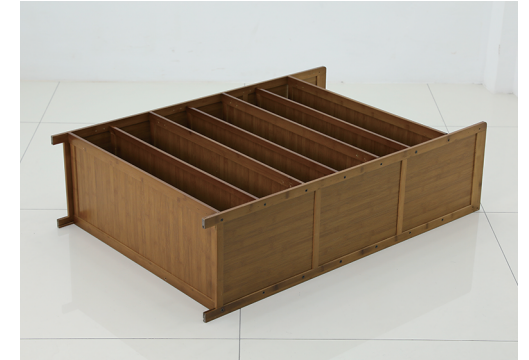
④ Secure Right Side Frame (b) with Large Screws (o).