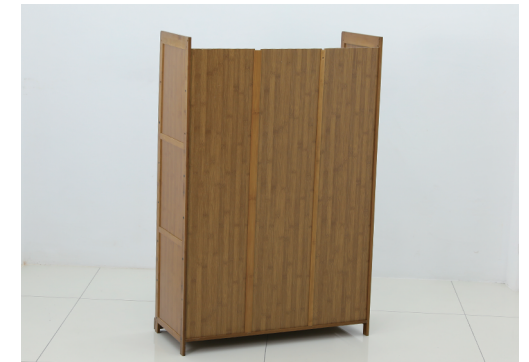
⑧ Position Back Panel (c), insert along the groove.