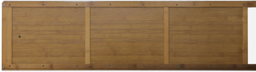
(b) Right Side Frame x 1