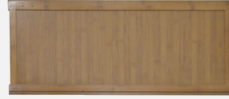
(k) Bottom Panel x 1 (With Slot)