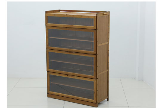
⑫ Position and secure Hooks (n) with Large Screws (o).