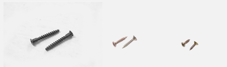
(o) Large Screw (p) Medium Screw (q) Small Screw