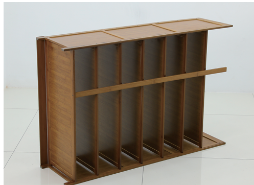
⑥ Turn over the shelf, position Slat (e), secure from the Bottom Panel (k) with Large Screws.