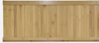
(j) Top Panel x 1