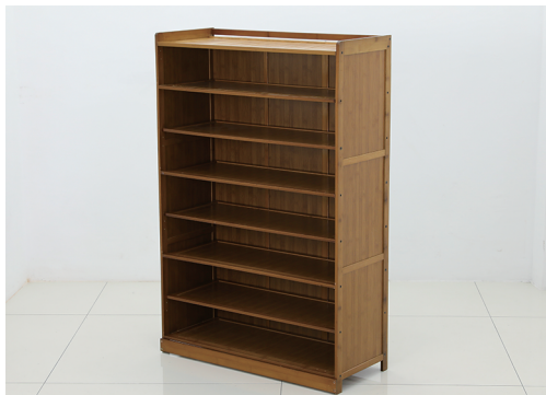
⑨ Position and secure Top Panel (j) and Back Slat (h) with Large Screws (o).