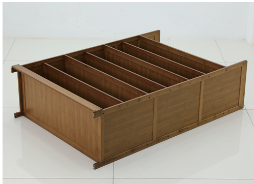
⑤ Position and secure Leg Cover (i) with Medium Screws (p).