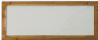
(f) Door x 2