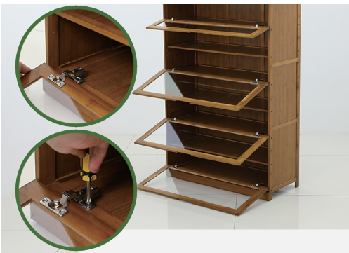
⑩ Secure Doors (f, g) and Hinge Panel (l) with Small Screws (q).