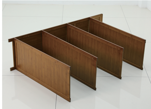
② Position and secure Hinge Panels (l) with Large Screws (o).