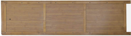
(a) Left Side Frame x 1