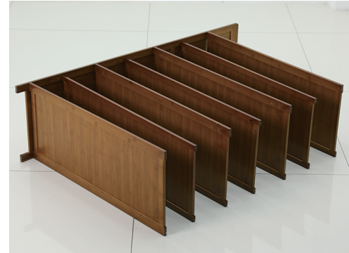
③ Position and secure Panels (m) with Large Screws (o).