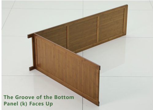
① Secure Left Side Frame (a) and Bottom Panel (k) with Large Screws (o). Groove on both panels has to be aligned.

The assembly instructions may vary depending on the number of tiers.