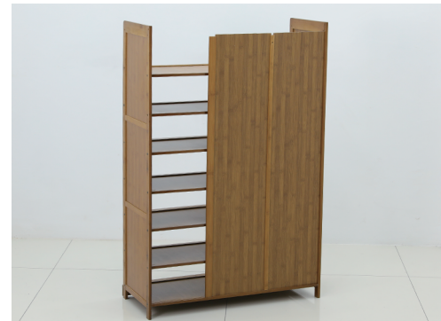
⑦ Position Back Panel (c) and Slat (d), insert them along the groove.