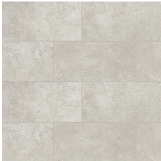
Sale - SAL ASCSTOSAL1224 12"x24" Rectified Field Tile - Matte