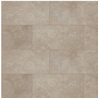
Sabbia - SAB ASCSTOSAB1224 12"x24" Rectified Field Tile - Matte