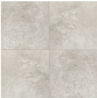
Sale - SAL ASCSTOSAL3636 36"x36" Rectified Field Tile - Matte