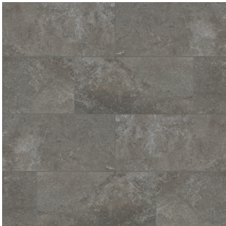
Terra - TER ASCSTOTER1224 12"x24" Rectified Field Tile - Matte