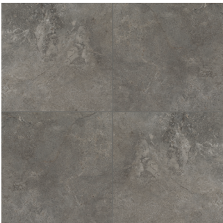
Terra - TER ASCSTOTER3636 36"x36" Rectified Field Tile - Matte