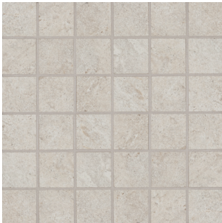
Sale - SAL ASCSTOSAL22MO