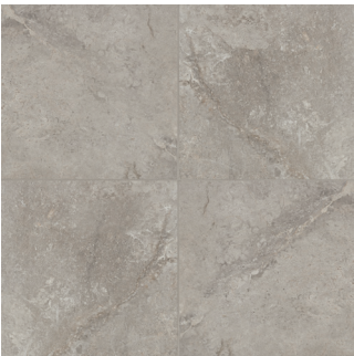
Cenere - CEN ASCSTOCEN3636 36"x36" Rectified Field Tile - Matte