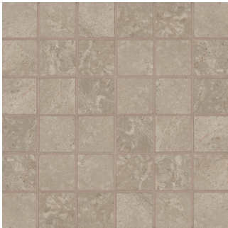
Sabbia - SAB ASCSTOSAB22MO