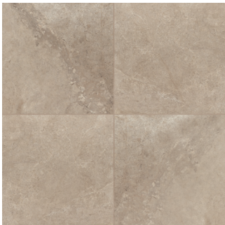
Sabbia - SAB ASCSTOSAB3636 36"x36" Rectified Field Tile - Matte