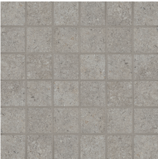
Cenere - CEN ASCSTOCEN22MO