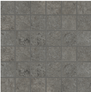
Terra - TER ASCSTOTER22MO