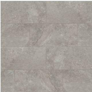
Cenere - CEN ASCSTOCEN1224 12"x24" Rectified Field Tile - Matte