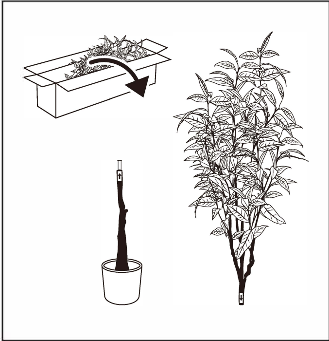
1、 Removing the plants from boxes.