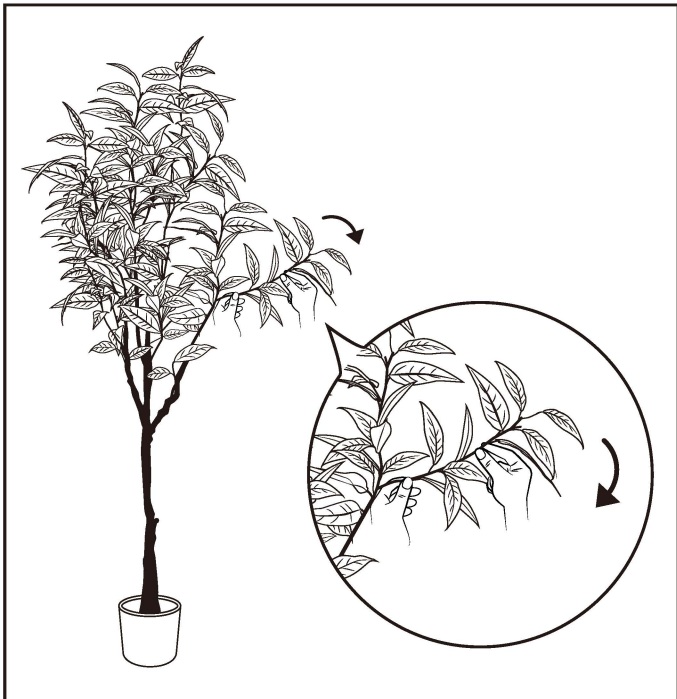
3、 Separate and fluff the trunk and leaves to achieve the desired level of fullness. (PS: Leaves are staggered for a better appearance).