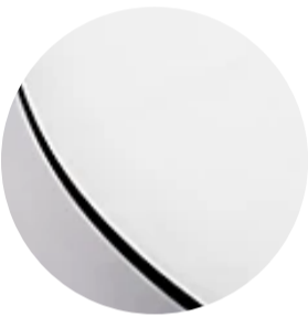
Polished Chrome - 260