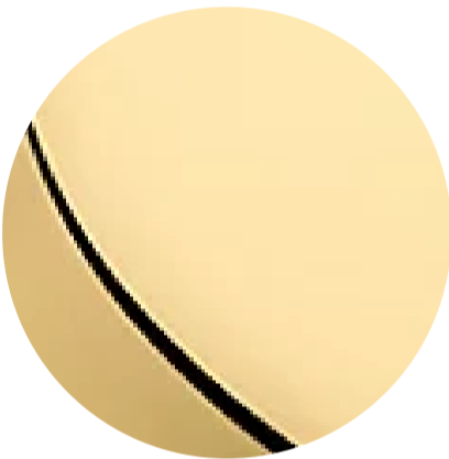
Lifetime (PVD) Polished Brass - 003