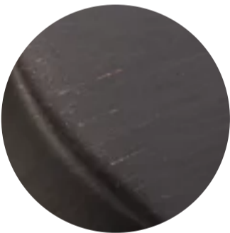
Venetian Bronze - 112, 11P