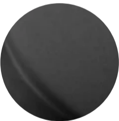
Satin Black - 190