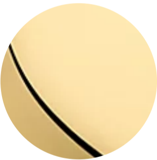
Non-lacquered Brass - 031