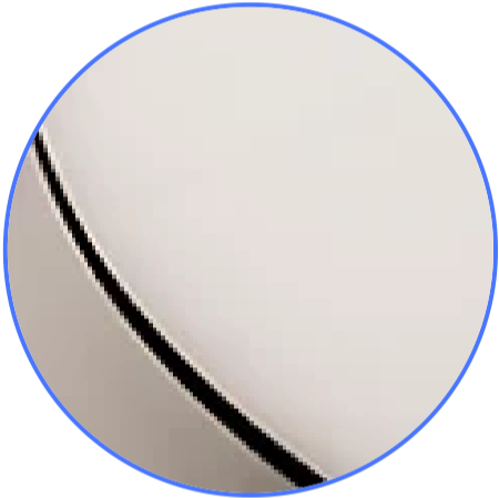
Lifetime (PVD) Polished Nickel - 055