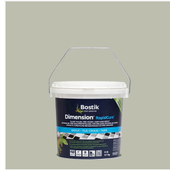
Dimension Rapidcure Diamon...