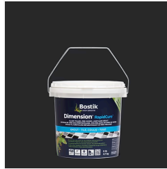
Dimension Rapidcure Onyx...