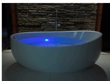
Chromatherapy-LED Lighting System