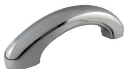
Standard Grab Bar