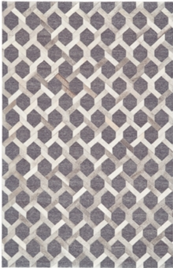
GRAY / ASPHALT