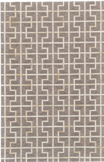
IVORY / BURLYWOOD