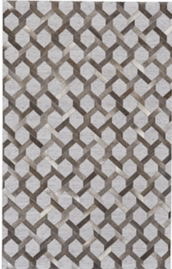
STEEL / STORM