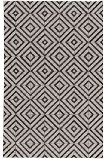
ONYX / GARGOYLE