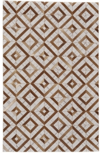
SUDAN / SAND