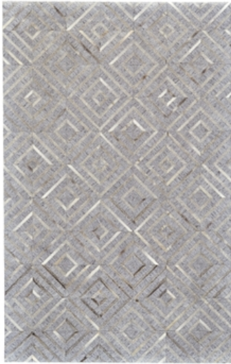
BISQUE / STORM