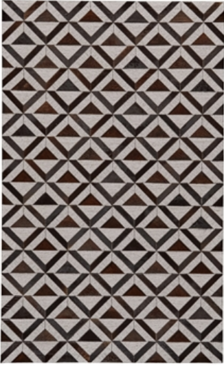
ONYX / BURLYWOOD