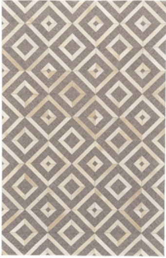
IVORY / BURLYWOOD