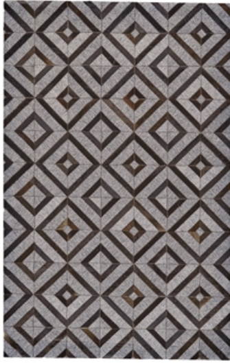
ONYX / ASPHALT