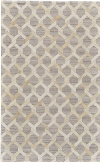
IVORY / SILVER