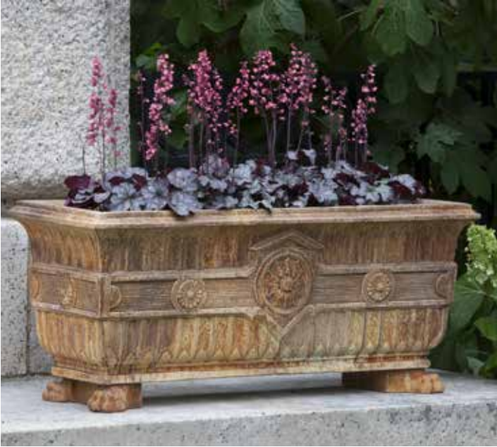
Shown in Ferro Rustico Nuovo

Available in a choice of thirteen (13) exclusive natural pigment stains in addition to natural. All of our patinas are hand applied in a multi-step process which produces unique and beautiful surface finishes. Designed to replicate the look of naturally aged materials, the patinas will not prevent the natural aging process that occurs in an outdoor environment. Rather than creating uniform stains, our approach gives our products their unique beauty and appeal.