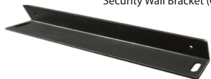
Security Wall Bracket (C)

Note: Due to varying wall structures, hardware (screws and anchors) for mounting the wall bracket are not included.