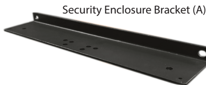
Security Enclosure Bracket (A)