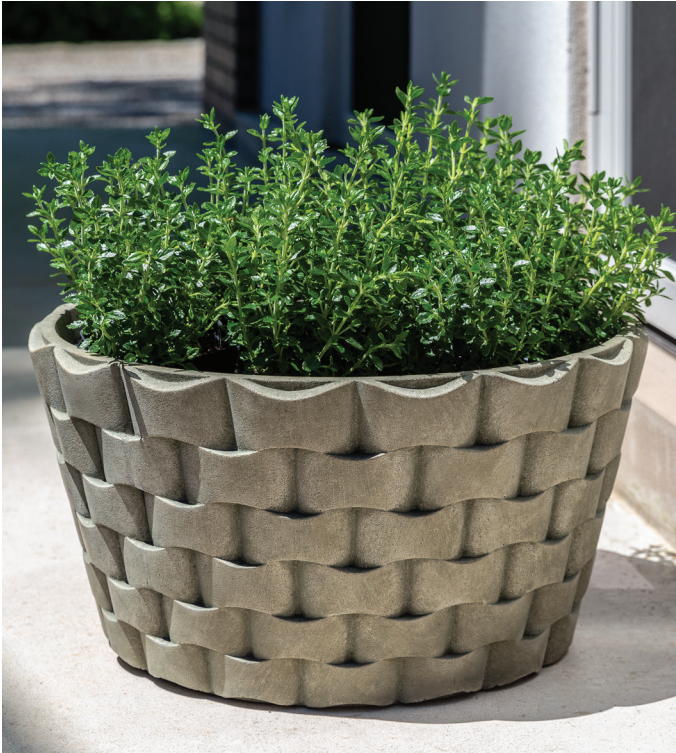
P-799 Shown in Alpine Stone