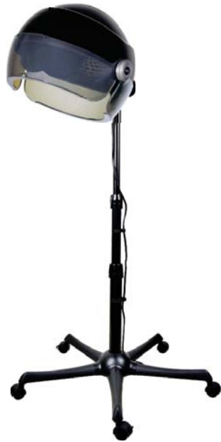
Operating Instructions / Safety Guide