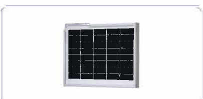
07 Solar Panel