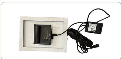
03 Solar Water Pump