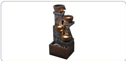
01 Water Fountain