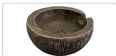
08 KD Part

*The water pump and transformer are housed in the same small box.