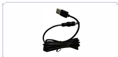
04 USB charging cable