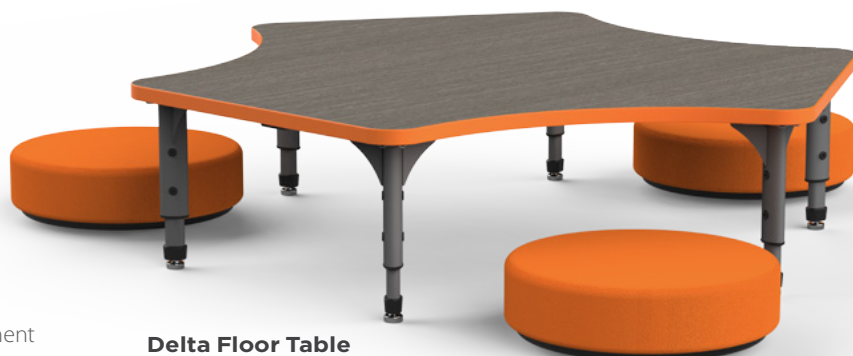
Delta Floor Table with Boardwalk Oak tabletop Gray leg/ Orange edge band Model 38-2251