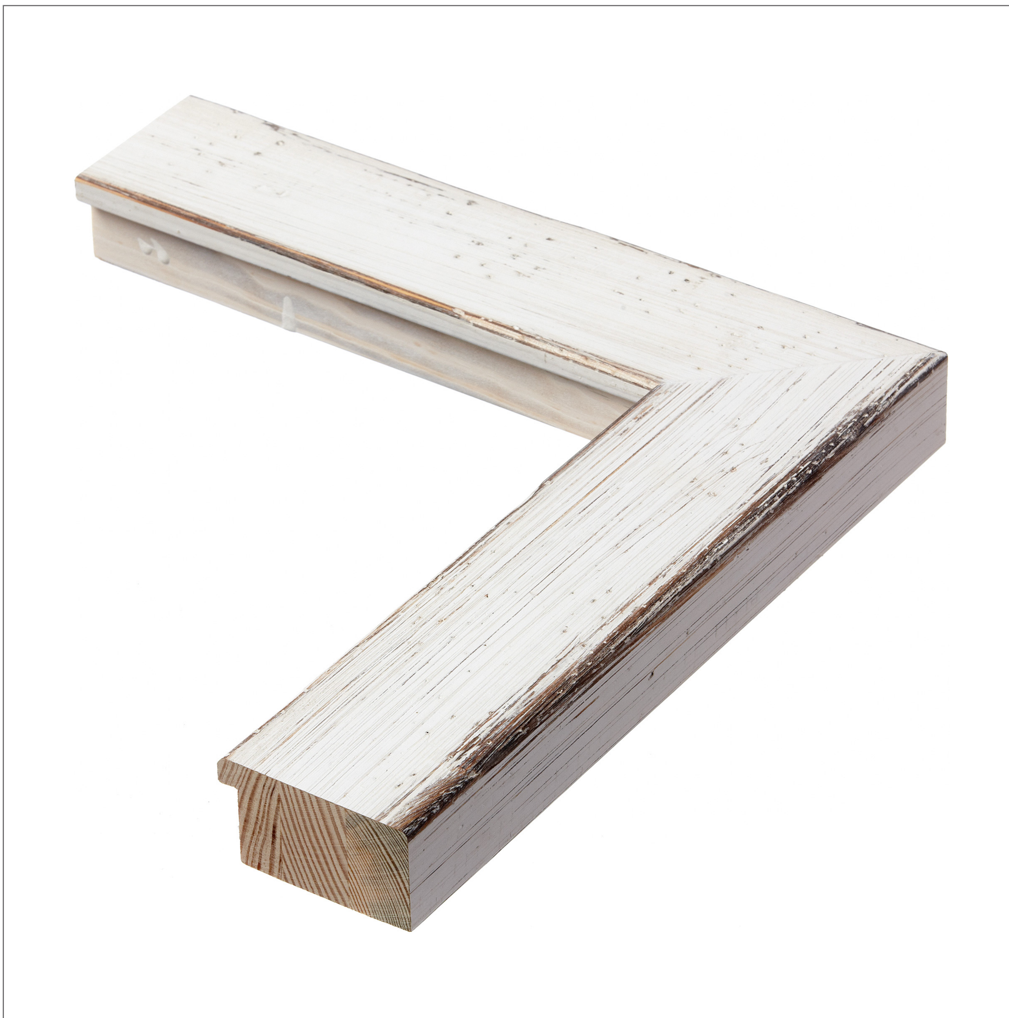
3D - Top Perspective