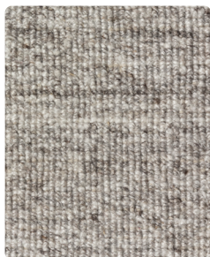
NK02 - SILVER