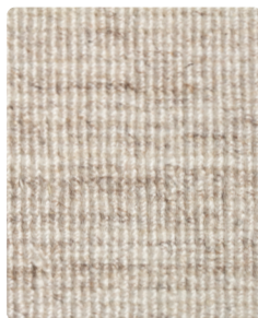
NK03 - BEIGE