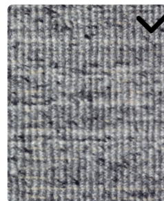
NK04 - DARK GREY