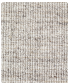
NK01 - LIGHT GREY