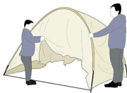
4. As you can see above drawing, you can use as a tarp using the upright poles.