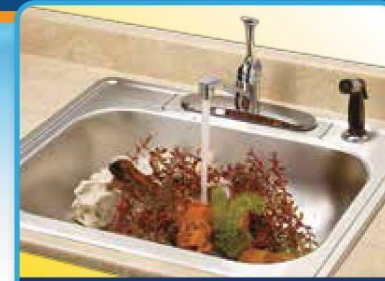
Rinse plants and décor items