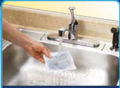
Rinse filter cartridge before use