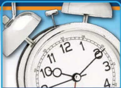
Wait 24 hours before adding fish