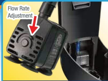
Adjust flow rate of pump as needed