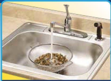
Rinse gravel in colander