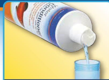
Add Water Conditioner to filter chamber as directed