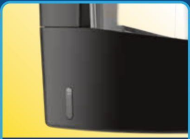
Fill to "Max" level on indicator