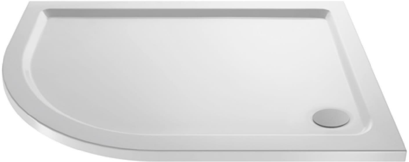
1000 x 800 OFFSET QUADRANT TRAY LH

DESCRIPTION: Offset Quad Tray Lh 1000X800x40