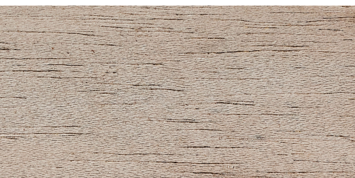
Natural Teak | New