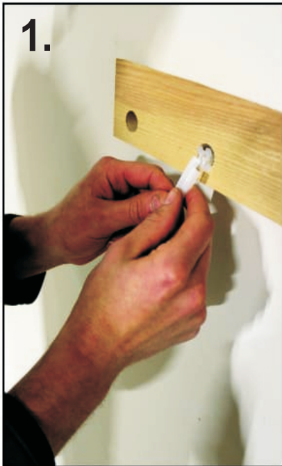
1. Insert the plastic dry wall anchor inside the hole drilled into the wall through the wooden support

ITEM DESCRIPTION : WALL MOUNTING BEDSIDE