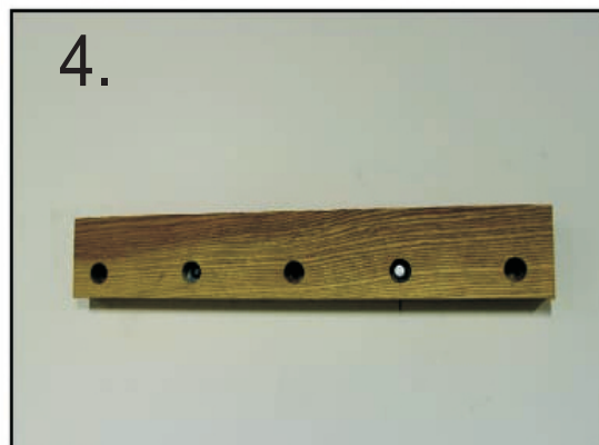
4. Fix all the screws firmly in the 5 slots provided