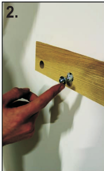
2. Thread the metal screw through the plastic washer until it threads till the wall