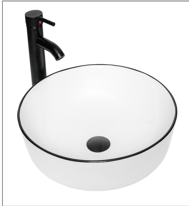
Bathroom Vessel Sink