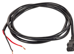
8ft electrical wire cut end included