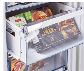
Multiple storage drawers for easy access