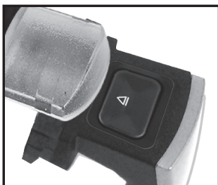
Basket Release Button (2)

The Sliding Button Guard helps to ensure you do not press the Basket Release Button by accident. Pressing the Basket Release Button causes the Outer Basket to separate from the Fry Basket and may result in injury if not done on a level, heat-resistant surface.