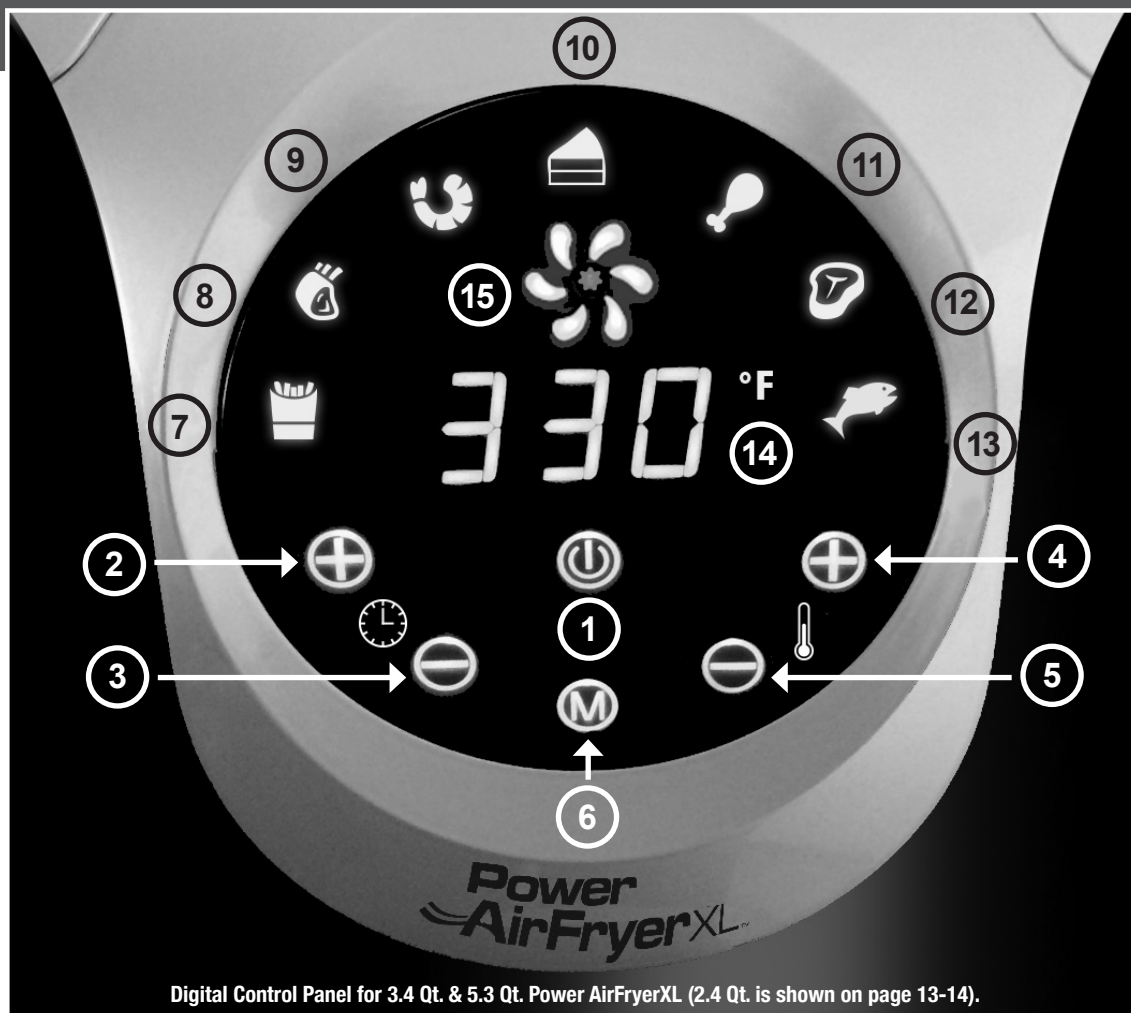
Digital Control Panel for 3.4 Qt. & 5.3 Qt. Power AirFryerXL (2.4 Qt. is shown on page 13-14).